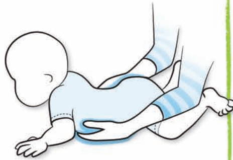
Hold them around their tummy. Pick up.