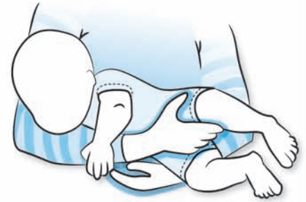
Place them face down along your forearm to carry.

Try and do this each time you pick up your child (e.g. following nappy changes or sleeping).