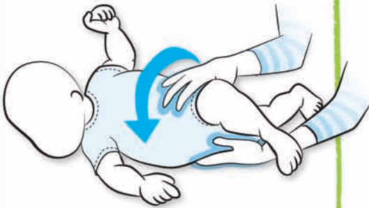
Roll your baby onto their tummy.